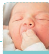
Hand to Mouth