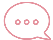
DIFFICULTIES WITH COMMUNICATING OR UNDERSTANDING