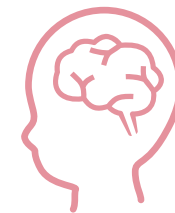
DIFFICULTIES WITH LEARNING AND CONCENTRATION